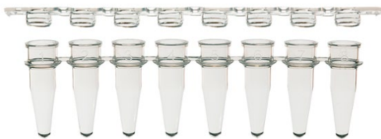
Combo Pack PR-PCR28CF