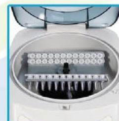
Holds up to 4 x 12 position PCR strips or 48 x 0.2ml tubes