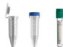
Accepts 5ml snap/screw cap tubes and 5ml blood tubes (12 x 75mm)