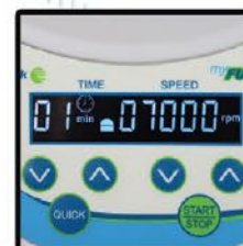
Digital display and control