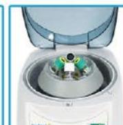
Includes rotor and accessories for all common blood and centrifuge tubes up to 5ml