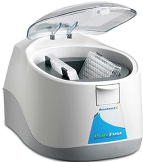
PLATE FUGE™ MICROPLATE MICROCENTRIFUGE