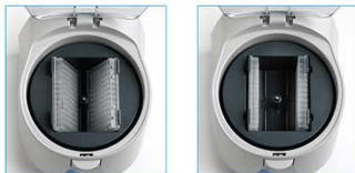
Before/After Centrifugation During Centrifugation

PCRCENT PlateFuge™ Microplate Microcentrifuge $894.54