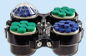
Tissue Culture Bundle