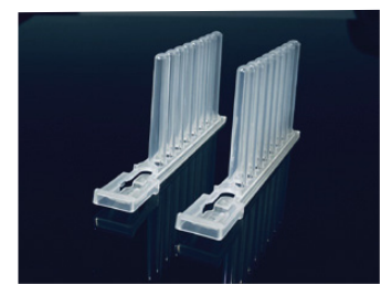
AP1016-MC 8-place tip comb