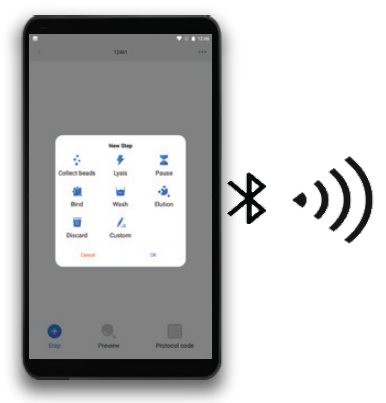
Create programs using any Android device, transfer via Bluetooth