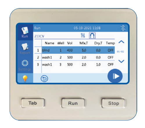
Touch screen control panel