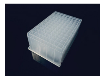
AP1096-DWP 96 deep well plate