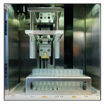
6-well sample strips loaded in aluminum rack