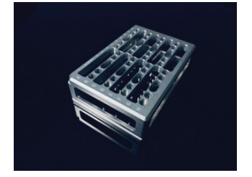
AP1016-ASR Aluminum rack