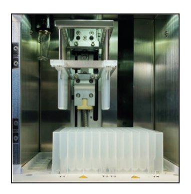
Deep-well plate for processing up to 16 samples

Accuris™ offers magnetic tip combs, deep well plates, and 6-well sample strips designed to fit the IsoPure™ Mini. Produced using virgin polypropylene and packaged in a sterile environment, these consumables are guaranteed to be contaminant-free. The 8-place magnetic tip combs lock into position inside the instruments processing chamber. There are 2 options for sample vessels: 96 deep-well plates can be used for processing up to 16 samples. For 8 or fewer samples, 6-well sample strips can be used, and these are loaded onto the included aluminum rack. These sample strips reduce waste and lower consumable costs when only a few samples need to be processed.