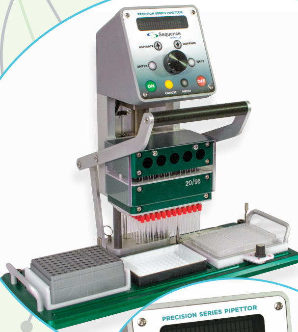
Precision Series Pipettor