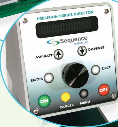
Intuitive Control Panel